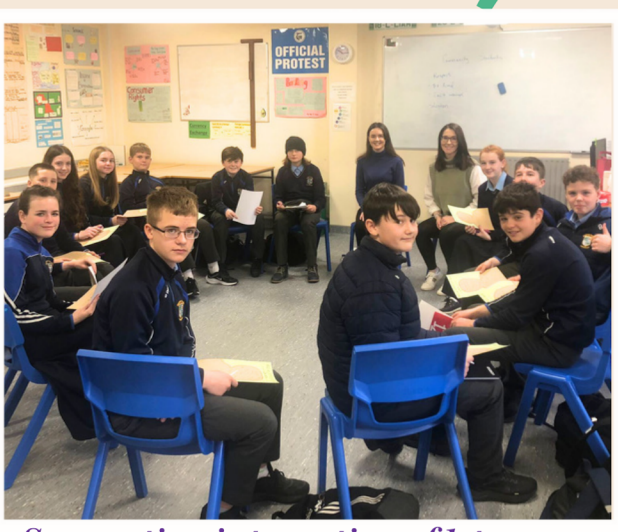
Supporting integration of 1st years

Students from Corpus Christi, Moyross shared in a virtual Story Exchange with students from the British International School in Cairo