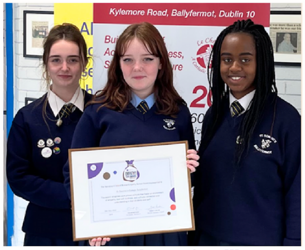
Creating a culture of wellbeing

St Dominic's College, Ballyfermot became the first Empathy School Awardee!