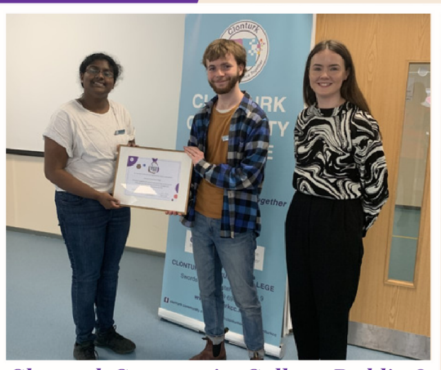
{\it Clonturk\ Community\ College,\ Dublin\ 9}