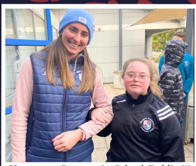
Hartstown Community School, Dublin 15