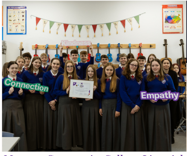
Mungret Community College, Limerick