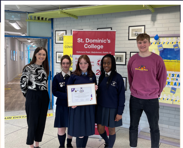
St Dominic's College, Ballyfermot, Dublin

Congratulations to all of the award winners!