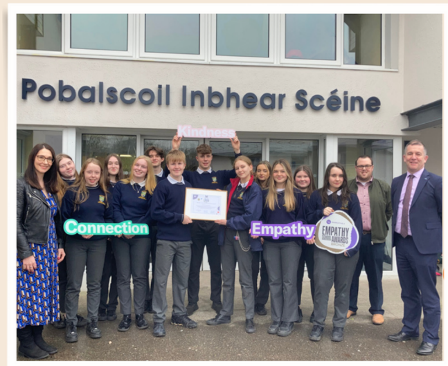
Pobalscoil Inbhear Scéine, Co. Kerry