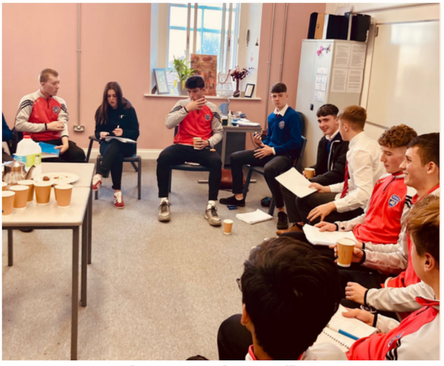
A safe space for reflection

TY students from Mungret Community College connected through the Story Exchange as part of their Empathy School Award