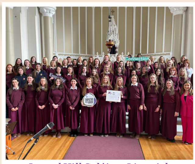
Laurel Hill Coláiste, Limerick