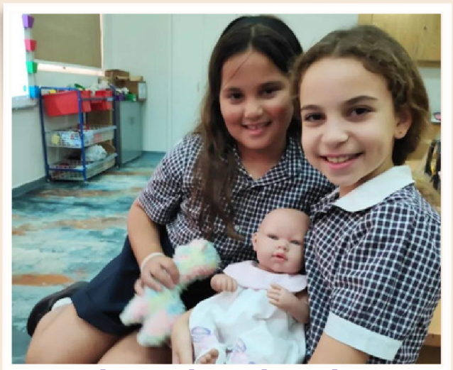
Understanding other cultures

St Dominic's College, Ballyfermot became the first Empathy School Awardee!