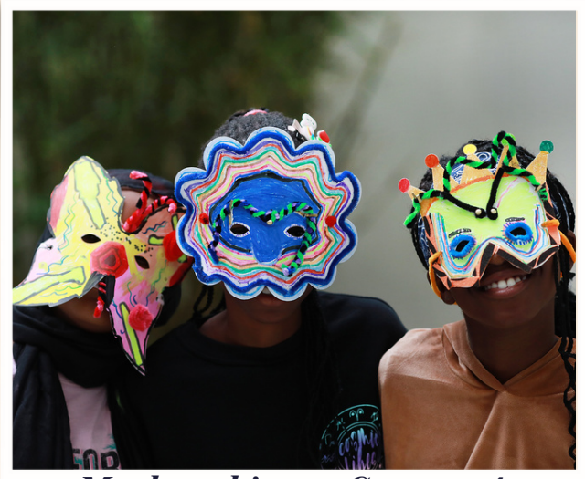
Mask making at Connect 4