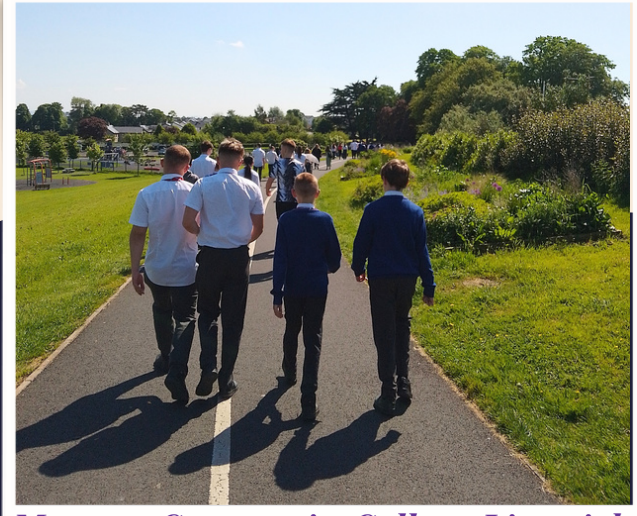
Mungret Community College, Limerick