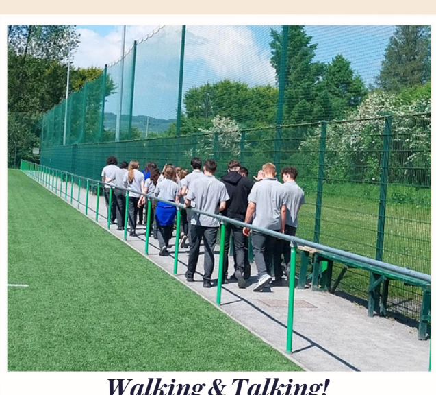
Walking & Talking!