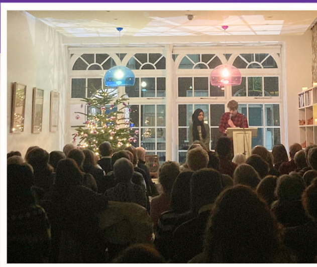
Students showcasing the story exchange