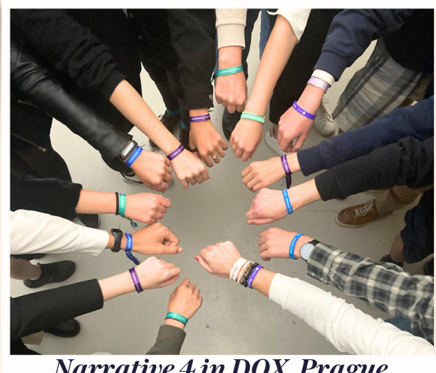
Narrative 4 in DOX, Prague