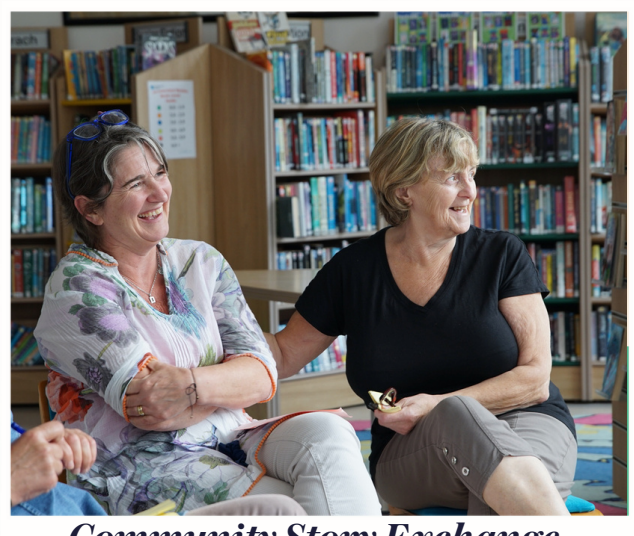
Community Story Exchange