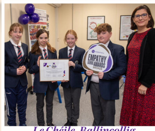
Le Chéile, Ballincollig