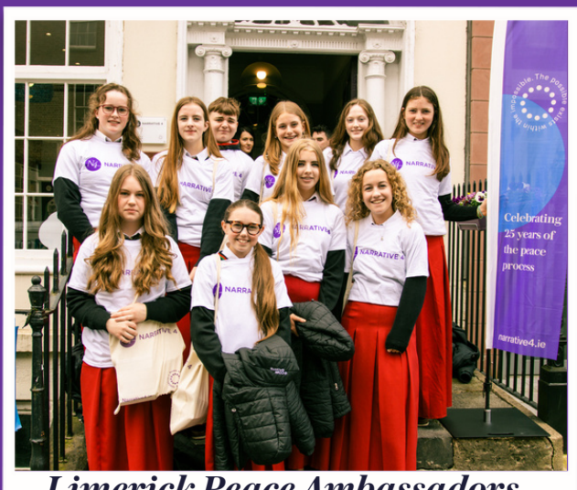
Limerick Peace Ambassadors