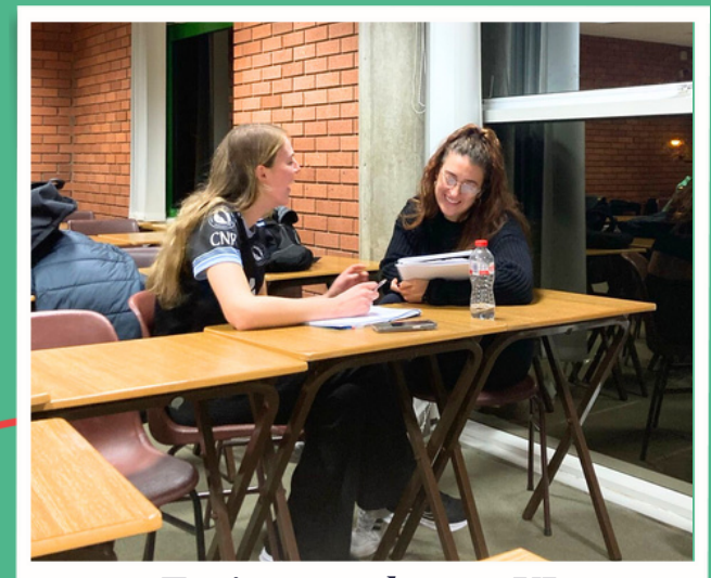
Trainee teachers at UL