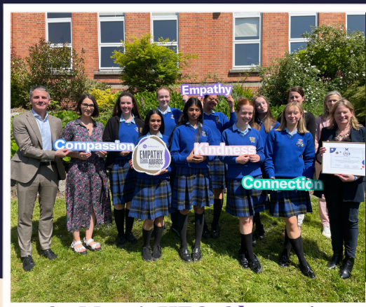
St. Mary's HFC, Glasnevin