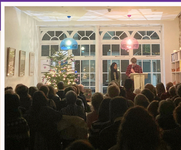
Students showcasing the story exchange