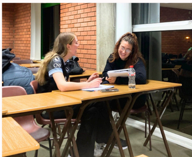
Trainee teachers at UL