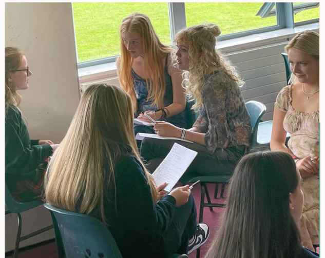
Danish and Irish Cultural Exchange