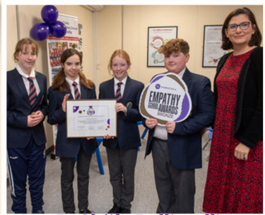
Le Chéile, Ballincollig