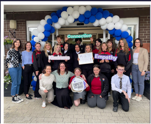
Beaufort College, Navan