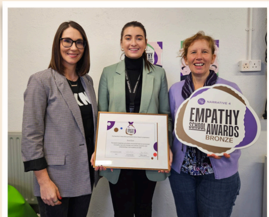
Scoil Eoin, Crumlin