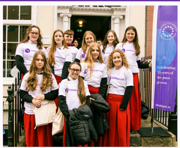
Limerick Peace Ambassadors