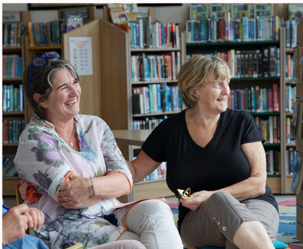
Community Story Exchange