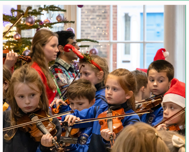
Christmas concert at Narrative 4