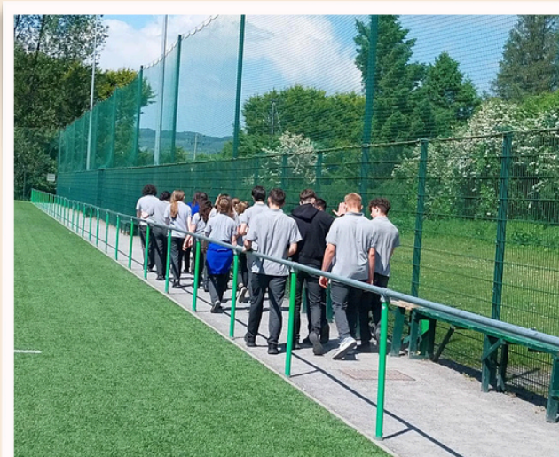
Walking & Talking!