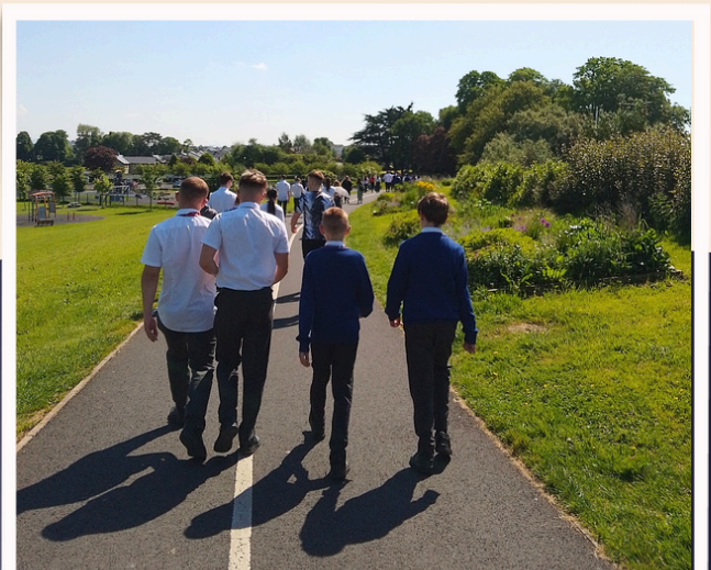
Mungret Community College, Limerick