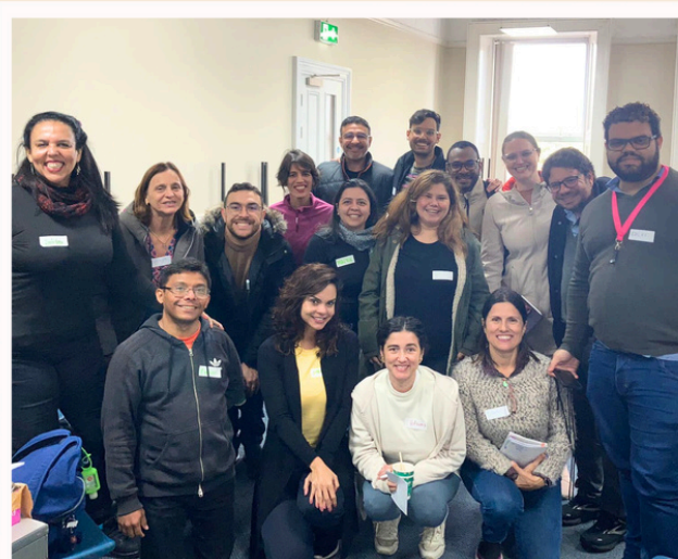
Brazilian teachers training with N4