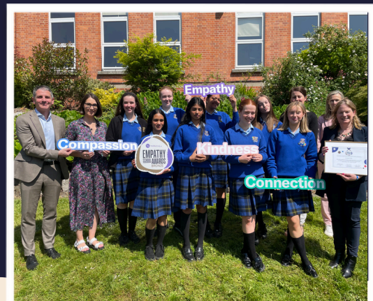
St. Mary's HFC, Glasnevin