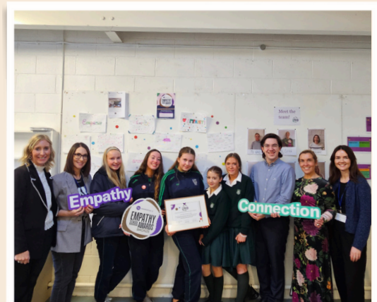
Santa Sabina Dominican College