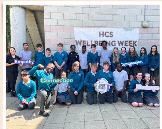
Hartstown Community School