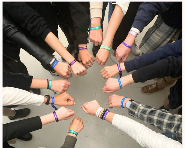
Narrative 4 in DOX, Prague