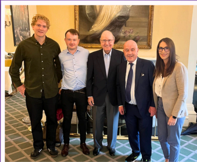
Meeting Senator George J. Mitchell