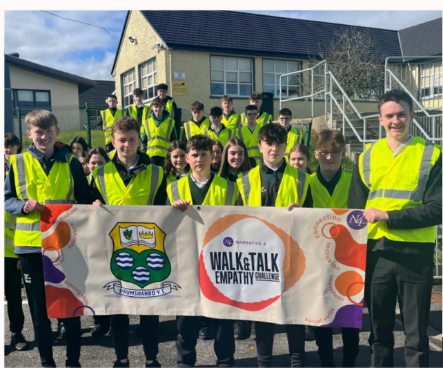
Drumshanbo Vocational School, Leitrim