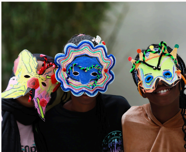
Mask making at Connect 4